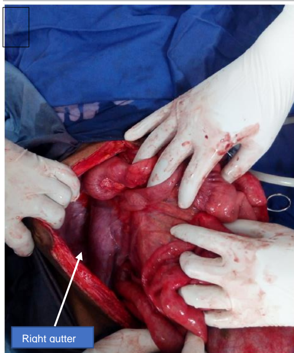
Figure 3: Cecum and ascending colon not fixed in the right gutter.