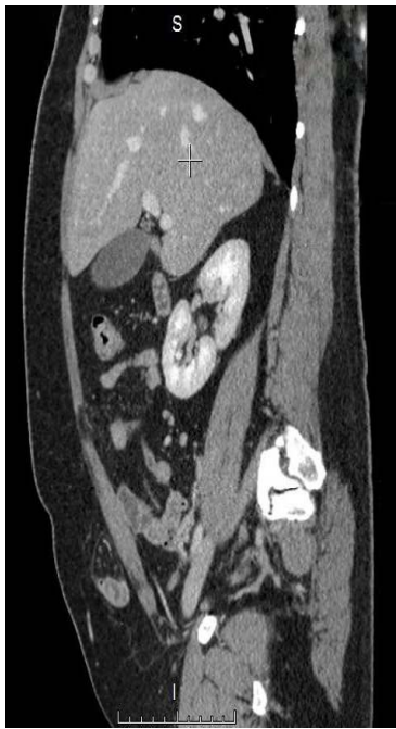
Figure 5. Computerized tomography image after 6 months: sagittal projection

and 6 months (Fig. 5). On the 4th month, the recovery was full, and the motor function of the oblique muscles was regained.