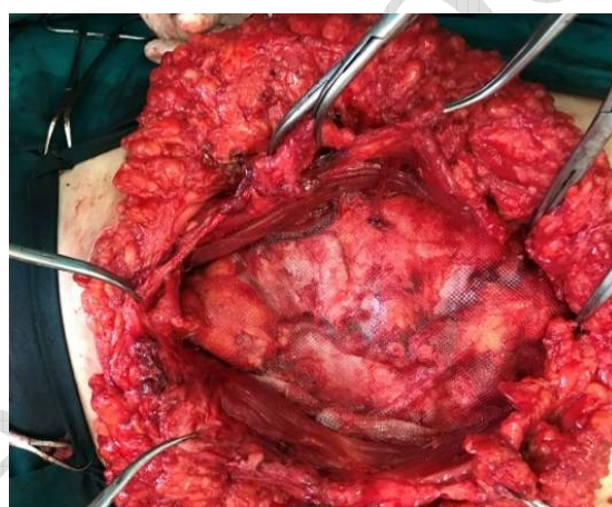
Figure 3. Layout of the mesh.

We used mesh Bard Adhesix® (BD, Franklin Lakes, NJ, USA) self-adhering hernia mesh (30×30 cm). It was cut according to the size and shape of the prepared bed (Fig. 3). After mesh placement, the anterior rectus sheath was sutured over the mesh by continuous Maxon sutures with medialization of the rectus abdominis muscles (Fig. 4). When suturing the anterior abdominal wall, a drain was installed in the subcutaneous tissue, which was sutured with separate catgut sutures.