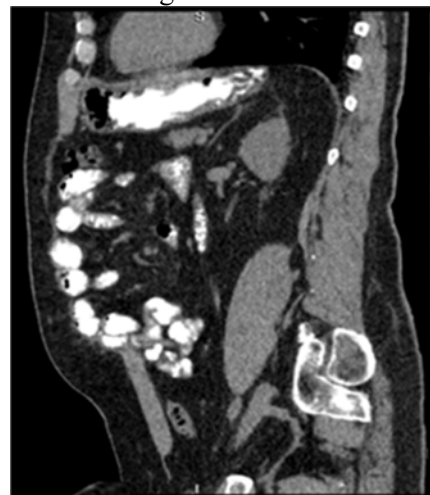
Figure 1. Computerized tomography image of the hernial defect in the sagittal projection

A 48-year-old woman underwent two operations. The first time was in 2015 due to perforation of colonic diverticulitis for which abdominal exploration and Hartmann's procedure were performed. A year later, in 2016, the reverse of Hartmann's procedure was done. Forty days after the second operation, she noticed a small hernia in the operative scar. At 1-year follow-up, abdominal computerized tomography (CT) revealed an irreducible hernial sac (30×17 cm) and two adjacent defects (50×58 and 28×50 mm) in the middle line of the umbilical region and lower abdomen from exiting loops of the intestine and mesentery (Fig. 1). There was also an empty sac (42×27 mm) in the abdominal wall. The distance between the medial edges of the rectus muscles was 23 cm; hence, the hernia was classified as M3W4 was according to the Chevrel–Rath classification (19).